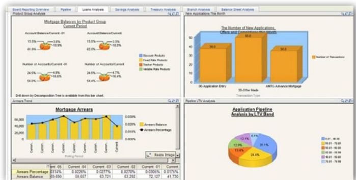
Use ALFI® for management information